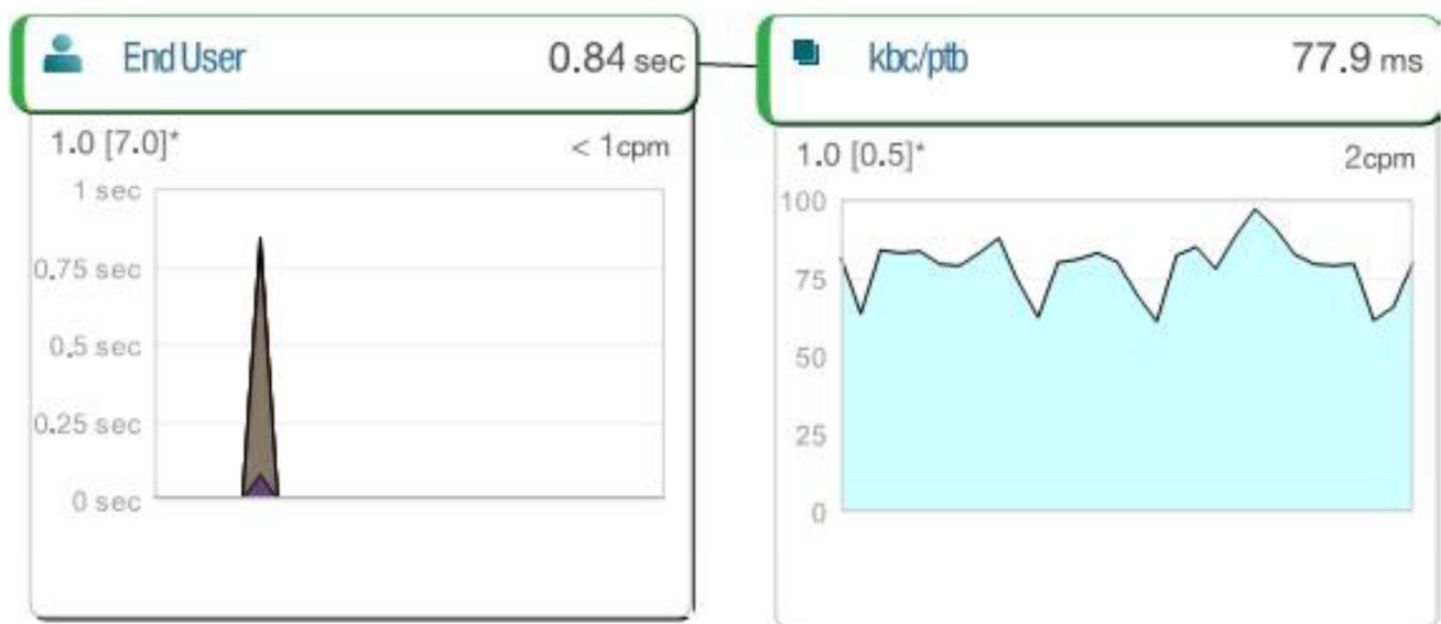
Figure 1. Brief MAP of usages of the SaaS monitored using Agent.

Summary MAP of the SaaS using Agent – Figure 1 has shows the overall MAP of the proposed SaaS with the help of the customized new relic agent.